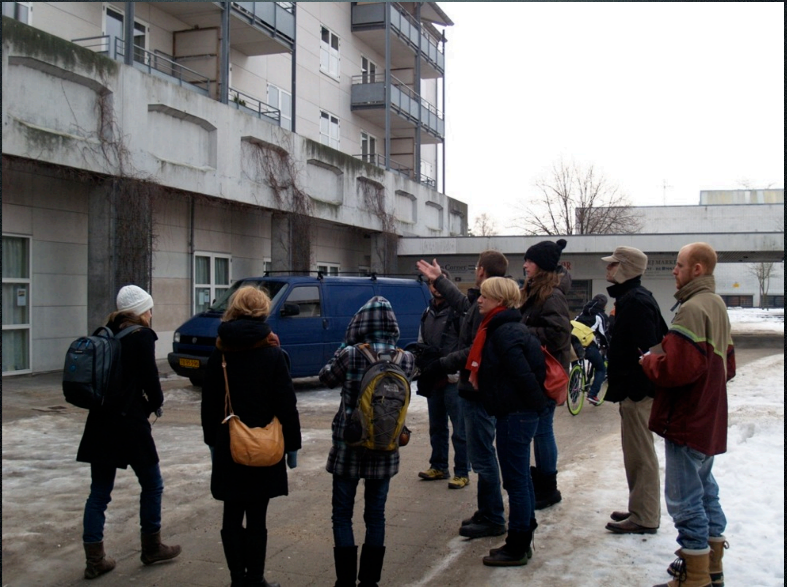
Friday, 4 February 2011